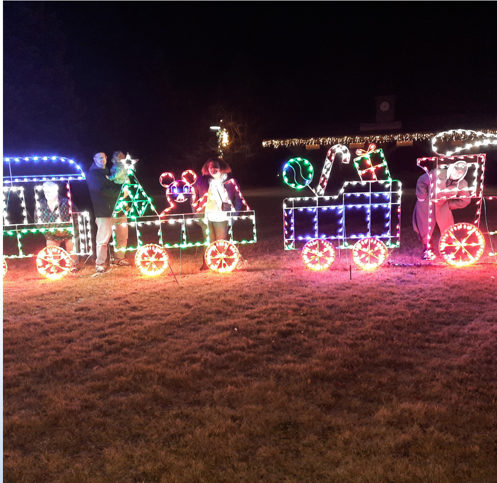
The Highland Station Ticket Gateway Park